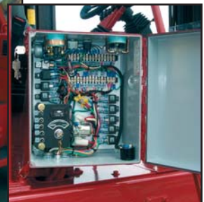
Sealed Electrical Box