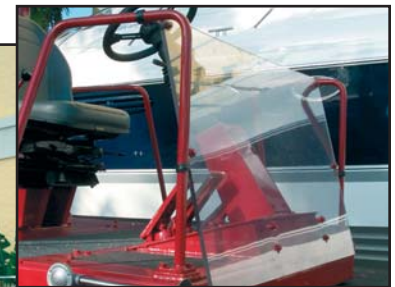
Optional Splash Guard